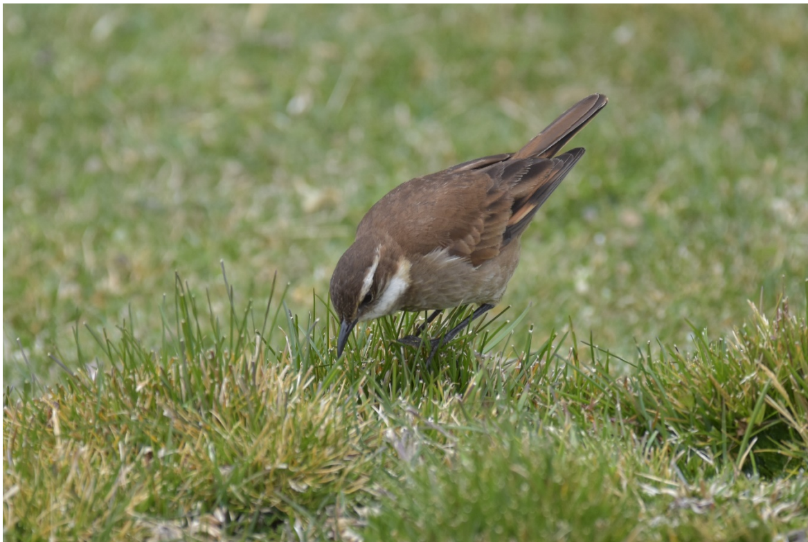
Figure 5. A Cinclodes albidiventris feeding near human habitations where it is common.