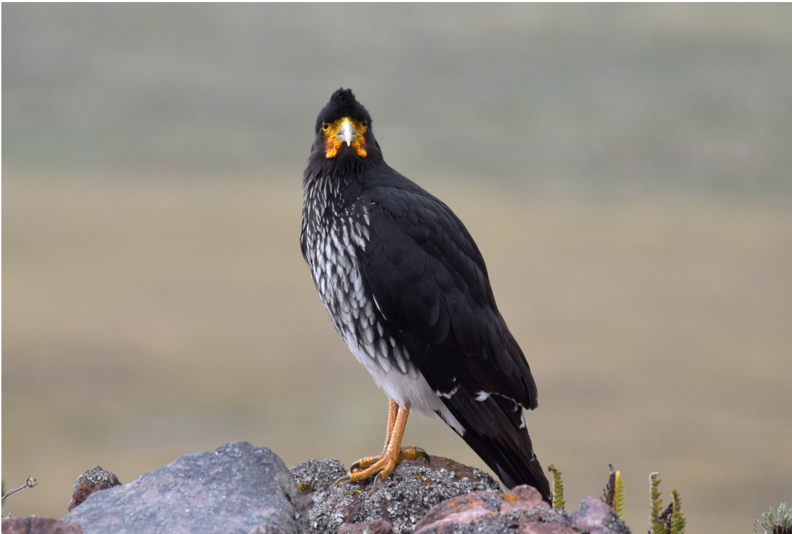
Figure 2. Known locally as curiingue, Daptrius carunculatus , can be easily seen by the dozens in meadows and low grasses at the Antisana Water Conservation Area. In other paramos, fewer than five individuals are usually seen during a bird-watching day.