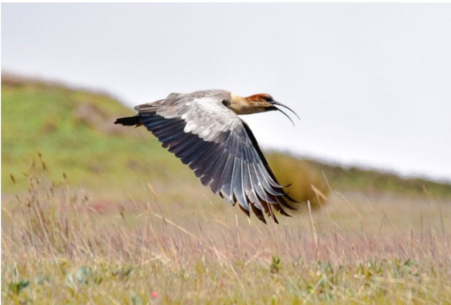
Figure 1. The only Ecuadorian population of Theristicus branickii is found at the southern border of the Cayambe National Park, south of the Cotopaxi National Park. They are most commonly encountered in the meadows of the Antisana Water Conservation Area.

For instance, the Antisana paramo is composed of a mixture of plant formations not recognized in previous classifications 2 that birds depend on for at least one life stage.