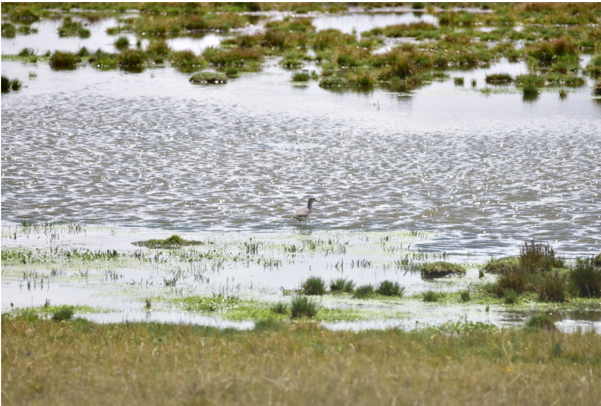
Figure 3. Bogs and high Andean lakes are important resting and feeding sites for Nearctic migrants, such as the Tringa melanoleuca (Greater Yellowlegs) feeding at the Santa Lucía lake at 4300 meters.