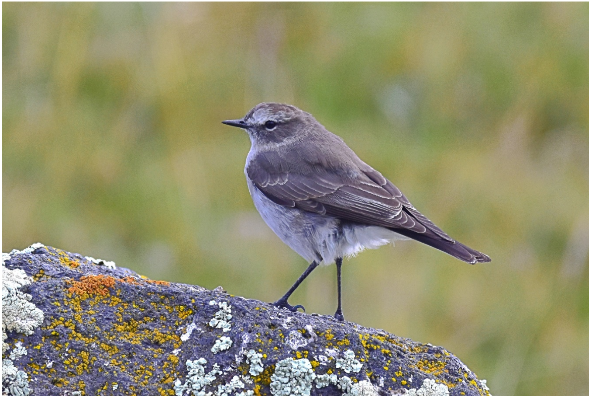
Figure 4. A Muscisaxicola alpinus perched on a rock near human habitations where this species is frequently encountered.