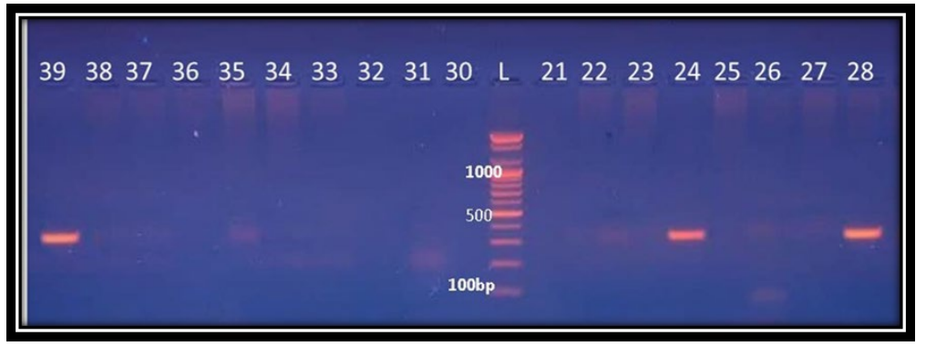
Figure 2. Amplification of bla-AIM gene by PCR from Pseudomonas aeruginosa isolates. lanes (4, 9, 24, 38, 39) show positive results of the bla-AIM gene with 322 bp.

S. maltophilia has shown high resistance to many antibiotics, including beta-lactams, aminoglycosides, and chloramphenicol because it contains genes carried on the chromosome such as blaL1 metallo \beta -lactamase and blaL2 \beta -lactamase genes, this was consistent with the isolate's resistance profile<sup>10</sup>. This result agrees with another study in Iraq showing that S. maltophilia possesses many resistance genes, the most important of which is the metallo beta-lactamase gene<sup>11</sup>.